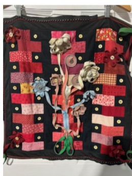
Zipper Day – April 24

BRING YOUR QUILT CHALLENGE TO THE JUNE MEETING