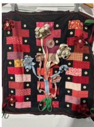
Zipper Day – April 24